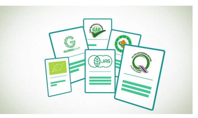
Risk-management for retailers